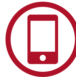
EMAILS AND TEXTS